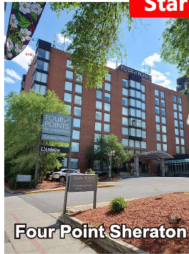
Four Point Sheraton

Proceed to the Canadian Museum of Nature (fee apply). Afterwards, we will return to Toronto, ending the tours to the largest Tulip Festive in the world.